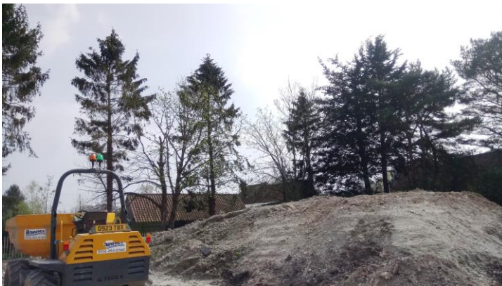
View of Norway Spruce (lower canopy) T2 and T3