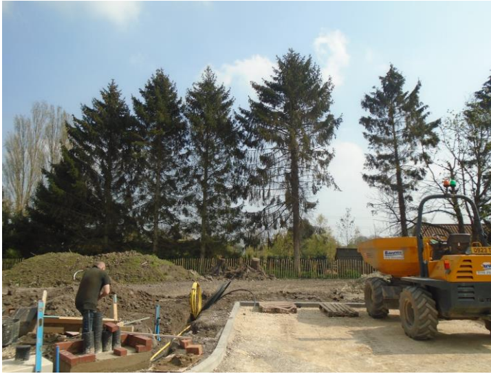
View of Norway Spruce (T7), Western Cedar (T5 and T6) and Scots Pine (T4)